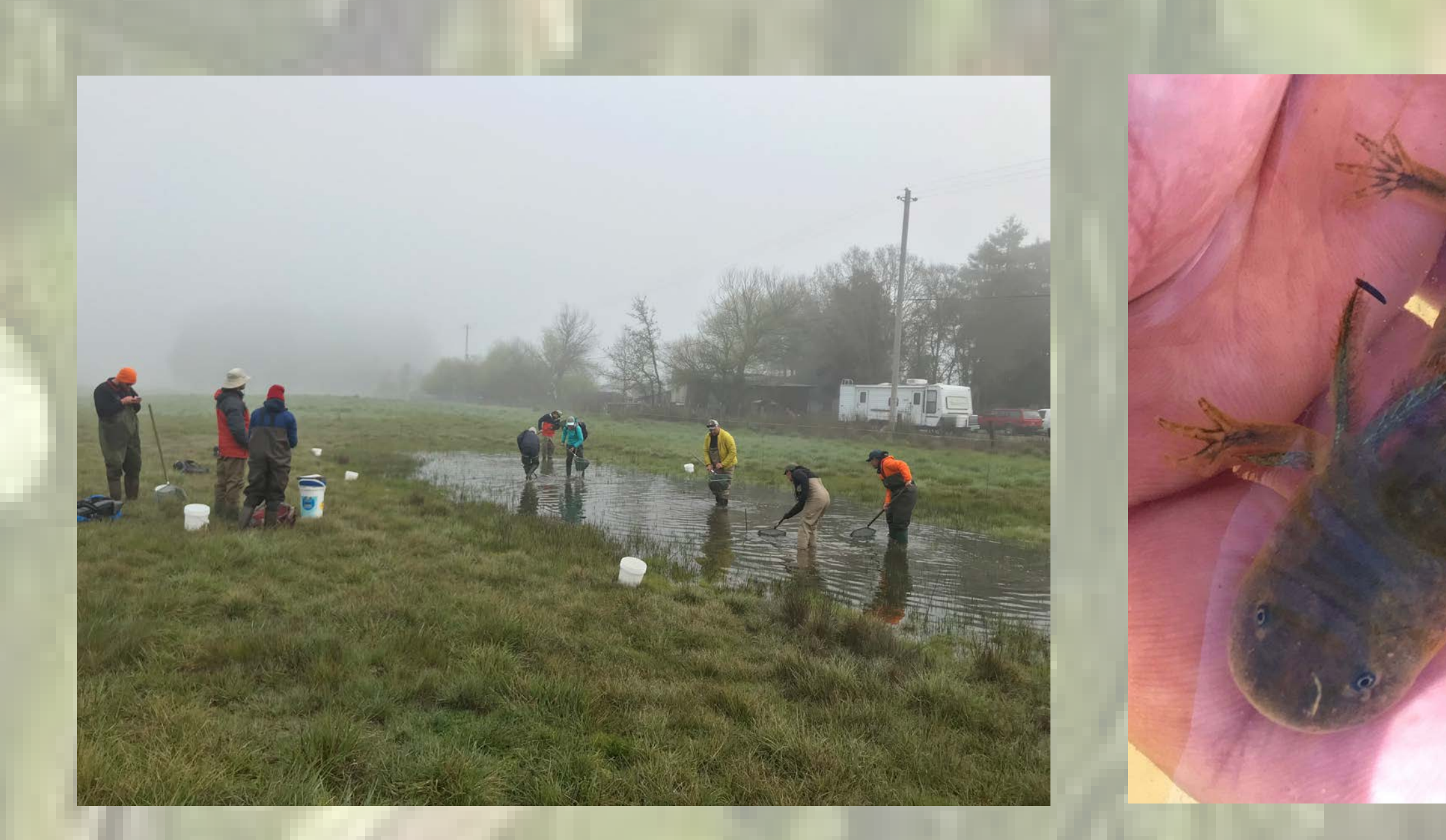
Figure 1. a) A vernal being sampled via dip-netting on the Santa Rosa plain and b) a California tiger salamander larva.