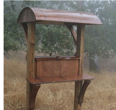
Sign in each time you

Submit Liability Waivers for each visitor by mail. Ensure they arrive at the Center at least one business day in advance of your visit. Forms may also be dropped off at Darwin Hall, Room 115. Liability Waiver for Adults ; Liability Waiver for Minors ; Liability Waiver for Minors Enrolled in Osborn Elementary School Program