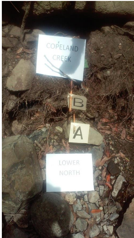
A and B