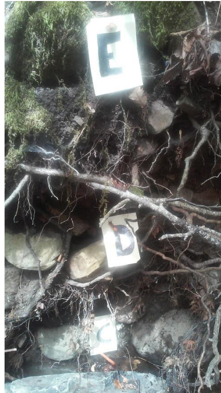
C, D and E