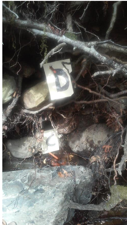
C and D